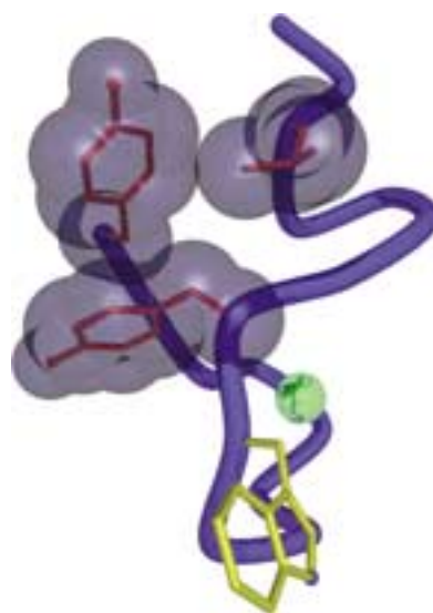
Figure 4. Ribbon structure of the LBT–Tb 3+ complex with the interaction amongst hydrophobic residues Tyr1, Tyr8, and Leu13 emphasized (red).

In addition to improving the luminescence intensity of LBT peptides, the other goal of this study was to improve the lanthanide affinity. During the design process, hydrophobic amino acids were added at the C and N termini to promote hydrophobic interactions that would preorganize the loop for metal-ion binding. Examination of the structure reveals an N terminus with an extended conformation that allows it to pack against the C terminus. A hydrophobic cluster formed by Tyr1, Tyr8, and Leu13 (Figure 4) appears to “cinch” the loop closed, thereby creating a pseudo macrocycle that is primed for ion binding. The importance of these interactions is emphasized by the diminished affinity of LBT mutants that perturb this hydrophobic cluster for Tb 3+ ions. Deletion of the N-terminal tyrosine residue reduces the terbium affinity 25-fold and the replacement of Tyr8 by an arginine residue reduces terbium affinity 120-fold. Replacement of Leu13 with an alanine residue reduces the affinity 36-fold. Conversely, deletion of the two C-terminal residues does not significantly